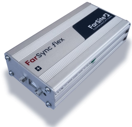
[FS4185] FarSync Flex+