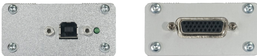
FarSync Flex End views

The FarSync Flex USB adapter is a high quality synchronous solution for business, government and military applications. Using the FarSite customisable communications controller it has been developed to provide a high performance, neat, durable solution with versatile connectivity for Linux and Windows systems.