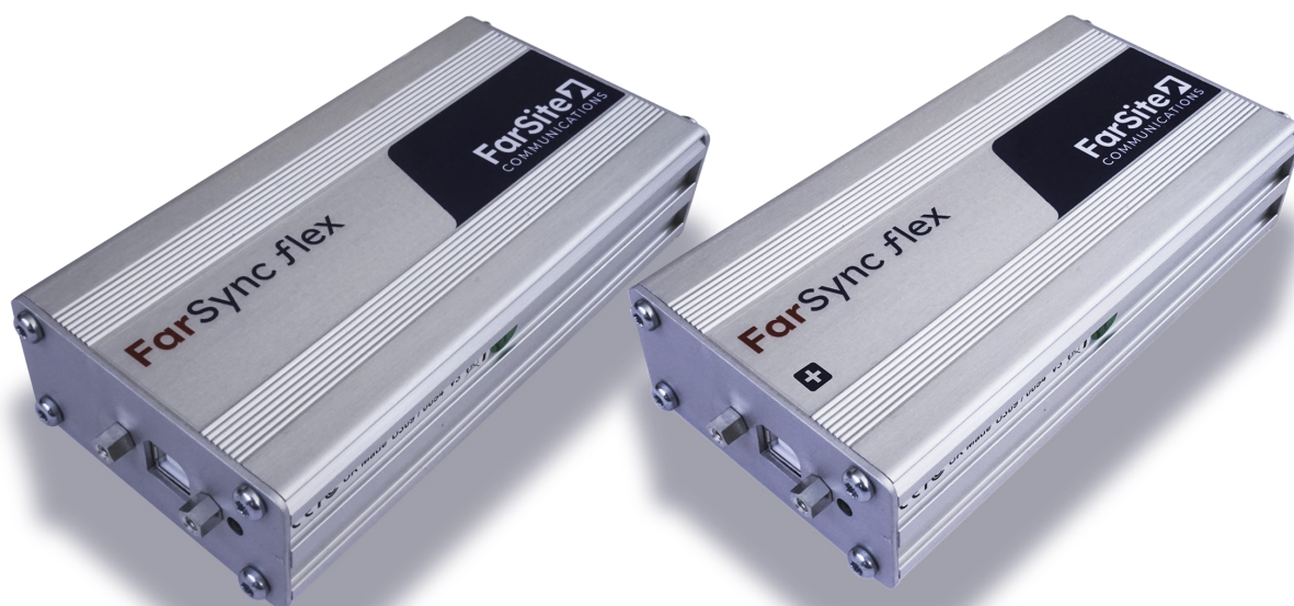
[FS4100] FarSync Flex USB Synchronous & Asynchronous adapter