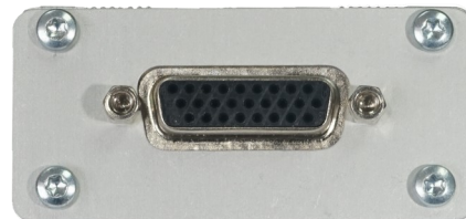
FarSync Flex End views

The bus powered USB adapter will support a sync line at speeds of well over 3 Mbits/s continuously; and async operation up to 115.2 Kbits/s. The highly flexible universal network connector supports RS232, X.21, RS530, RS422, RS449, RS485 and V.35 network interfaces.