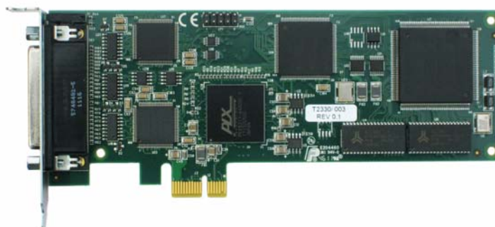
FarSync X25 T2Ee fitted with the supplied low profile I/O bracket

New releases of the software are made available for free download from www.farsite.com .